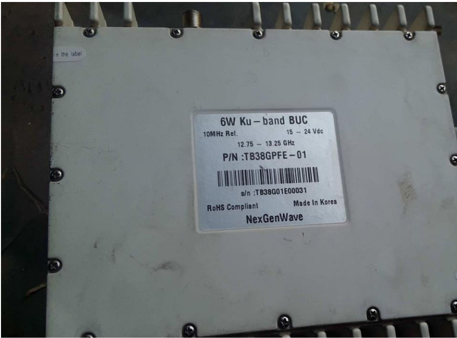
Figure 3: Specifications of the BUC used in the remote sites.