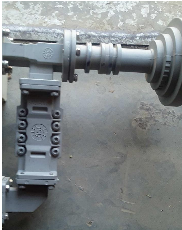
Figure 5: The Feed Horn, OMT and Reject filter used in the remote sites.