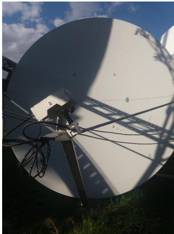
Figure 7: 2.4m Ku-Band antenna used in the remote sites.