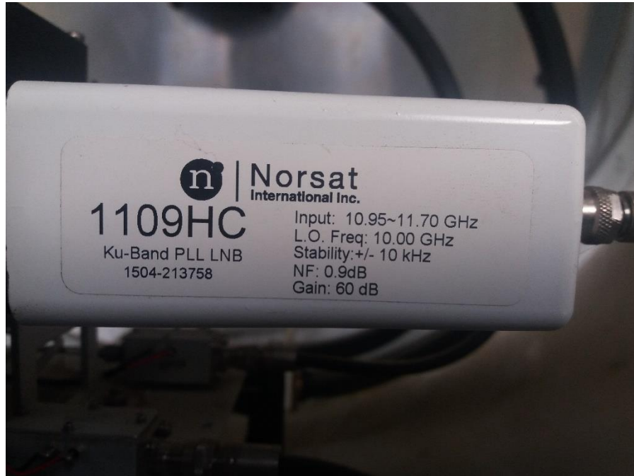
Figure 2: Specifications of the LNB used in the HUB antenna.