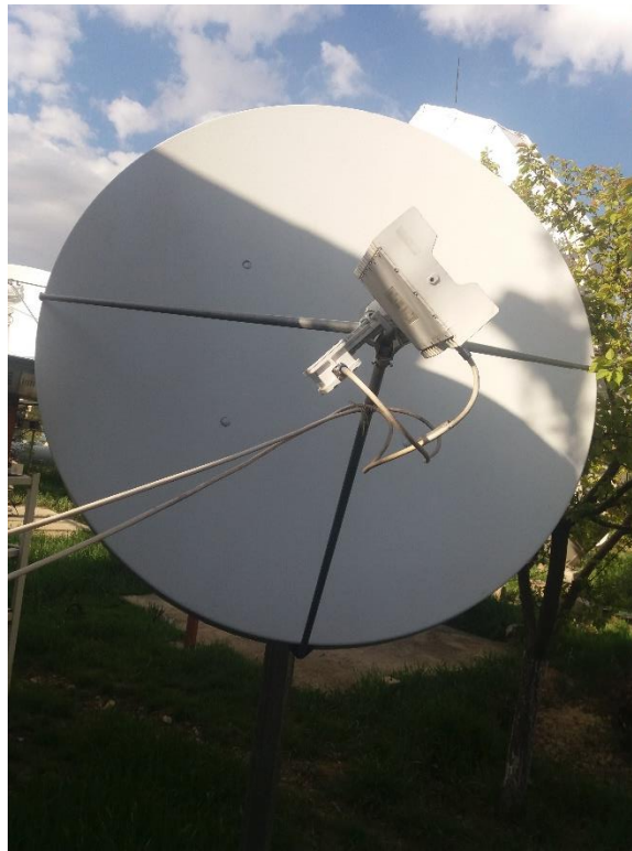
Figure 6: 1.8m Ku-Band antenna used in the remote sites.